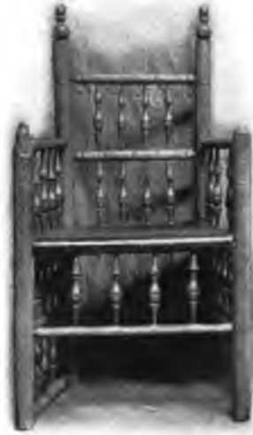
ELDER BREWSTER'S CHAIR