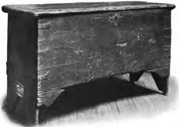
THE BREWSTER CHEST

At the Connecticut Historical Society Rooms, Hartford